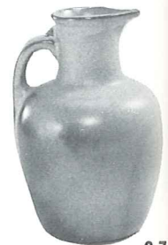
3.75 8—24 OZ. PITCHER

HONEY JUGS Not Available in Terra Cotta.