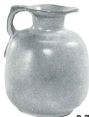
3.75 833—24 OZ. PITCHER