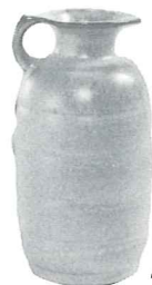
3.75 831—16 OZ. PITCHER