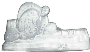
1206—10" CACTUS PLANTER (No Terra Cotta or Flame) 6.00