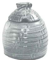
803—HONEY JAR W/LID 4.75