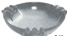
5.00 458—7" THREE SIDED

Small containers perfect for miniature or dried arrangements.