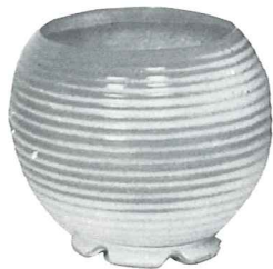
6.50 70-B—5½" RINGED JARDINIERE