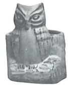
394—5" OWL PLANTER 5.00