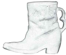
C-33—5" BOOT MUG 4.00