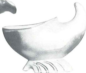
57—7" CORNUCOPIA 5.50