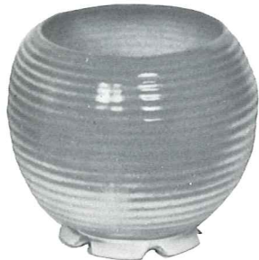
9.25 70-A—7" RINGED JARDINIERE