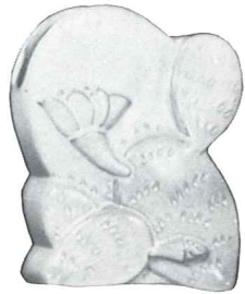
1205—7½" CACTUS VASE (No Terra Cotta or Flame) 6.00