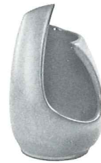
302—6" CANDLE VASE 4.75