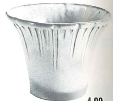
4.00 A6—6" JARDINIERE