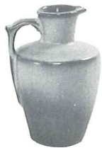
838—10 OZ. PITCHER 3.25