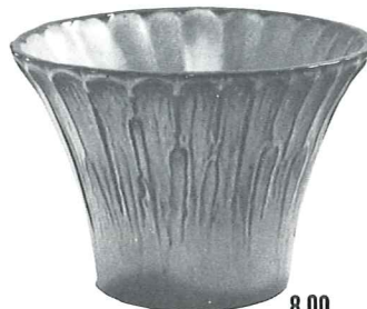
8.00 A8—8½" JARDINIERE Not Available in Flame