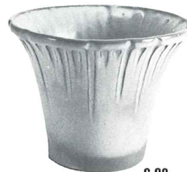
6.00 A7—7" JARDINIERE