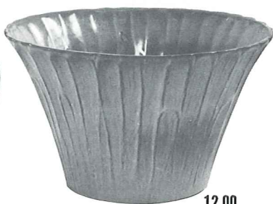
12.00 A10—10" JARDINIERE Not Available in Flame