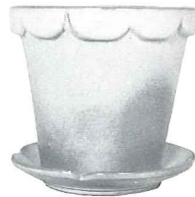
395—6" PLANTER W/SAUCER Bottom Drain Hole Will Hold 4" Container 10.00