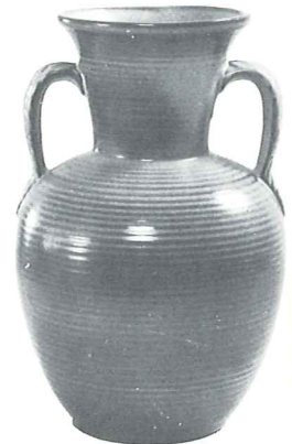
71—10" LEAF HANDLED VASE 15.00