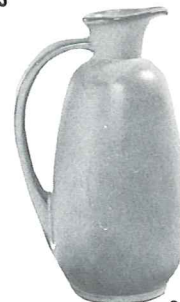
3.75 835—24 OZ. PITCHER